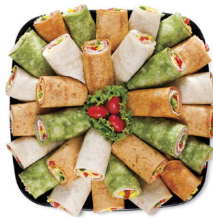
That's A Wrap Assortment Turkey, Italian Combo, Roast Beef, Roasted Veggie with cheese, lettuce & tomato or choose your selections Serves 10 – $28 Serves 18 – $45