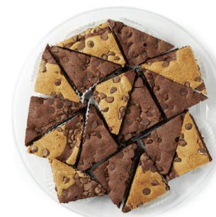
Brownie Platter Assorted Brownie & Blondies Serves 25 – $25