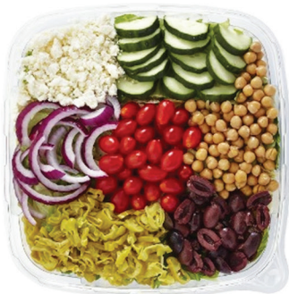
Greek Salad Lemon Vinaigrette

Serves 16 – $33 Serves 24 – $50 (5 shrimp per person)