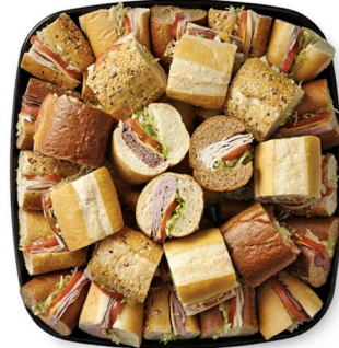
Hoagie Assortment Oven Roasted Turkey, Italian Combo, Roast Beef with cheese, lettuce & tomato on assorted sub rolls Serves 18 – $43 Serves 28 – $63