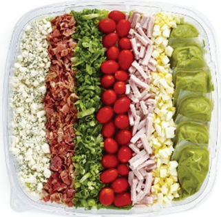
Turkey Cobb Avocado & Ranch Dressing