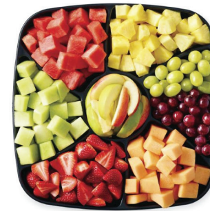
Fresh Fruit Platter Assorted Fresh Seasonal Fruit Serves 18 – $35 Serves 28 – $45