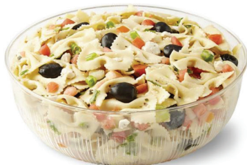
Pasta Mia Fresh pasta salad with tomatoes, olives, onions, peppers, cannellini beans tossed in an EVO Italian dressing Serves 10 – $24