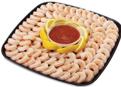
Chilled Shrimp Platter Served with lemons and cocktail sauce

Serves 16 – $33 Serves 24 – $50 (5 shrimp per person)