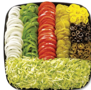
Relish Tray Serves 18 – $28 Serves 28 – $33