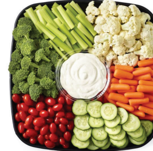
Crudité Fresh Vegetable Served with Avocado Ranch Dip Serves 18 – $30 Serves 28 – $35