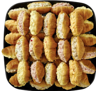
Assorted Mini Croissants Tuna, Egg, and Chicken Salad Serves 18 – $34 Serves 28 – $40