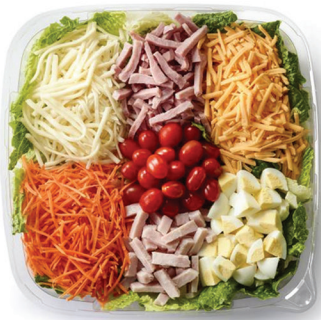
Wild Wing Chef Salad Italian Vinaigrette