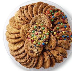
Cookie Monster Assorted Cookie Platter Serves 25 – $23