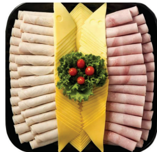
Deli Party Tray Over Roasted Turkey, Black Forest Ham, Swiss & Cheddar Cheese Serves 18 – $50 Serves 28 – $60